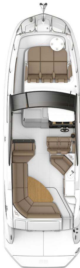
DECK / COCKPIT LAYOUT (Shown w/ Optional Equipment)

NOTE: Some features and options may not be available when a boat is built for regions outside North America and/ or has CE Certification. Boats ordered with 220V/50 cycle electrical systems will have the appropriate appliances in the corresponding voltage.